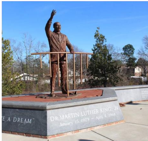
MLK, Jr. Park

North Carolina Federation of Colored Women's Clubs, Young Adult and Youth Clubs, Inc .